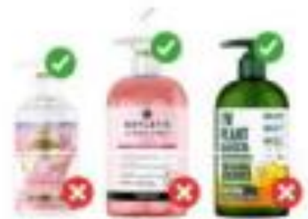
Household cleaning products